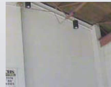
Visual Image of Wall

FLIR's new FUSION functionality allows for easier identification and interpretation of infrared images. This advanced technology enhances the value of an infrared image by allowing you to overlay it directly over the corresponding visible image. This functionality combines the benefits of both the infrared image and visual picture at the push of a button. The B400 camera does this in real-time and the overlay function can be easily adjusted to suit any application such as electrical surveys, building diagnostics, and mechanical inspections.