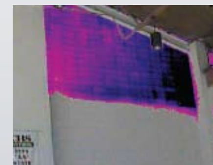
Fusion Image Showing Missing Insulation