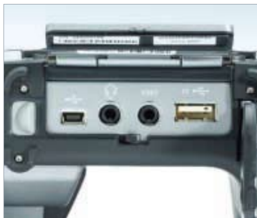
From Left to right: USB mini for PC image download, 4 pole audio for voice annotation, NTSC video, USB-A for memory stick image transfer